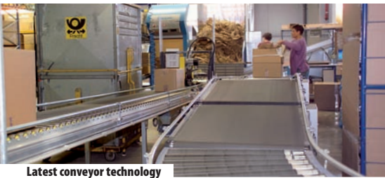
Latest conveyor technology