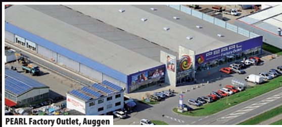
PEARL Factory Outlet, Auggen