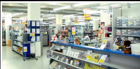
PEARL Factory Outlets, Pratteln · Spreitenbach · Basel City