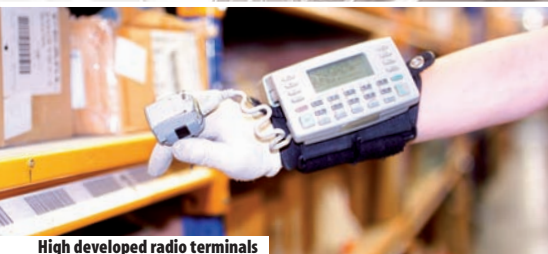
High developed radio terminals