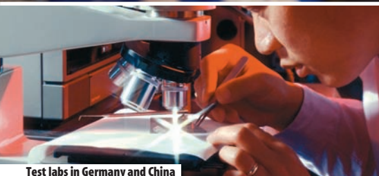
Test labs in Germany and China