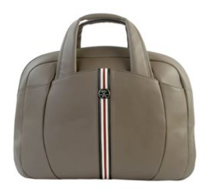
Holy Cow Real Leather™ Laptopbag fits 15", 15"W and PC

Beauty is in the eye of the purse string holder. So flaunt what your mama gave you and tote this luxury Holy Cow Leather™ super fine laptop chariot around. Earth tone colors, water resistant lining, special pockets for all of your status to help boldly proclaim , "I have arrived and so I don't have to eat noodles from a paper cup, ever again."