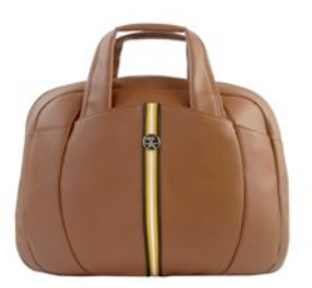
mud brown / mustard