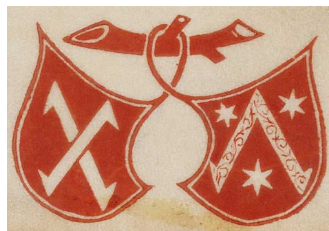
World-famous: The allianc signet of Fust & Schöffer