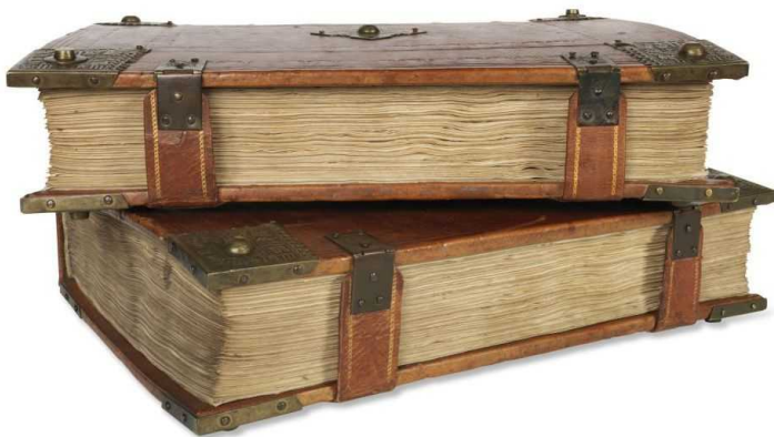
The Book of Books: The Fust-Schöffer-Bible