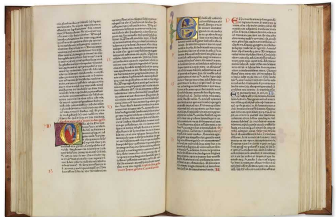
Gutenberg in perfection: The Fust-Schöffer-Bibel

The extremely rare complete copy, entirely printed on parchment and with marvelous illuminations, of this acclaimed print work is absolutely at eye level with the Gutenberg Bible, and will definitely catch collectors' fancy. However, investors will surely be likewise interested in this highly fascinating form of investment.