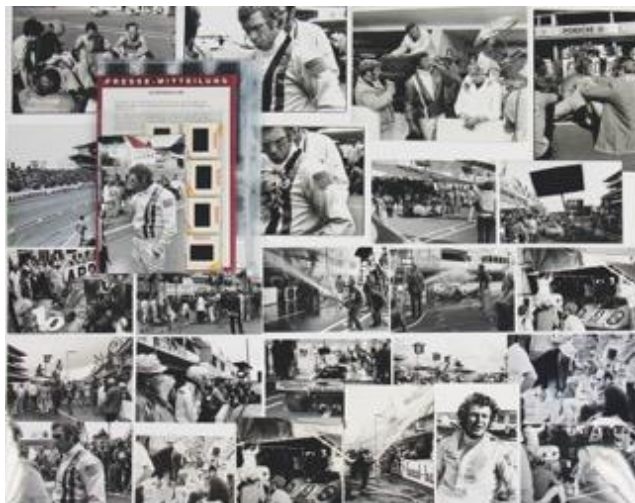
Negatives of Le Mans film with Steve McQueen, result €1,778