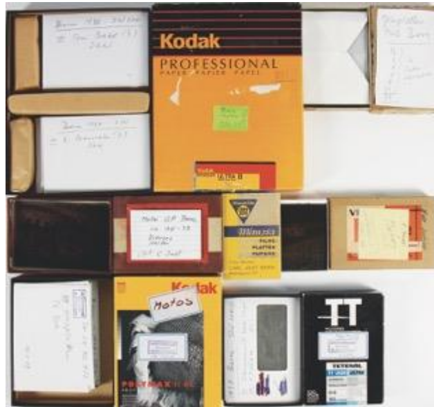
negatives of the Bern Grand Prix 1936-1938, result €3,556