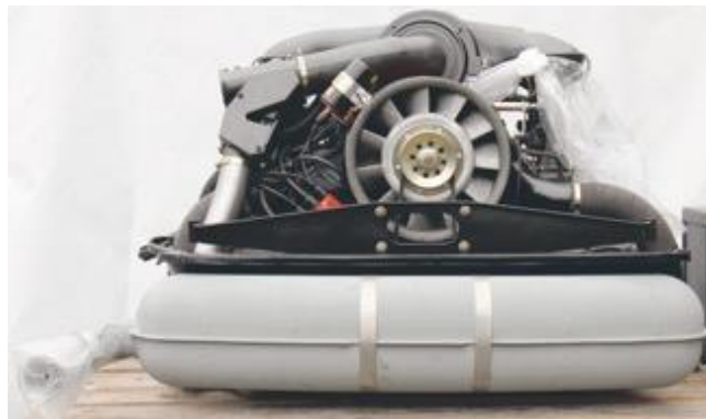
Engine unit from a Porsche 2.7 Carrera RS, selling for €71,100