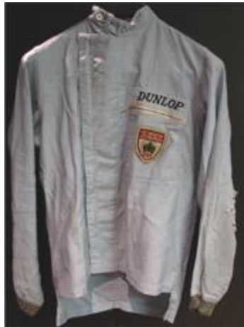
Original racing suit of Jim Clark fetched €29,640