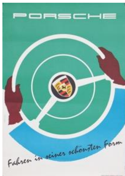
Porsche advertising poster from 1956 " Fahren in seiner schönsten Form " (Driving at its most beautiful), result: €7,230