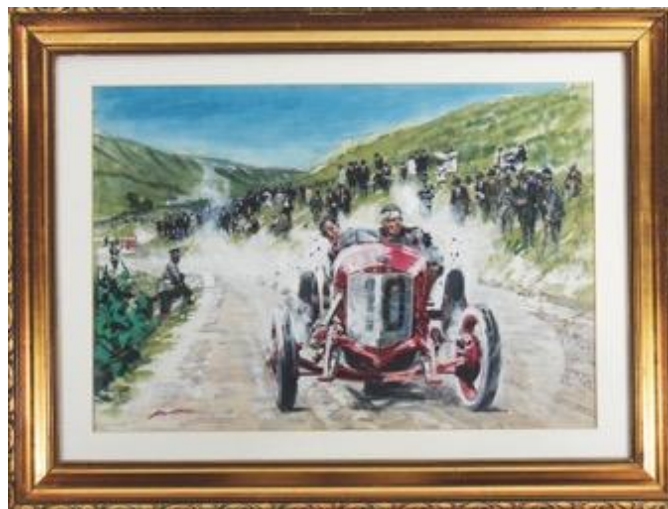
Walter Gotschke painting Targa Florio 1924, result: €7,110

www.automobilia-ladenburg.de info@automobilia-ladenburg.de Tel.: 0049 (0) 6203-95 77 76 Mobile: 0049 (0) 152-33 77 25 73