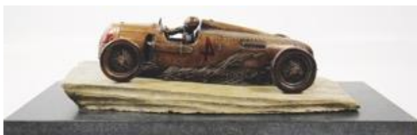
Auto Union bronze sculpture Bernd Rosemeyer, result: €7,700