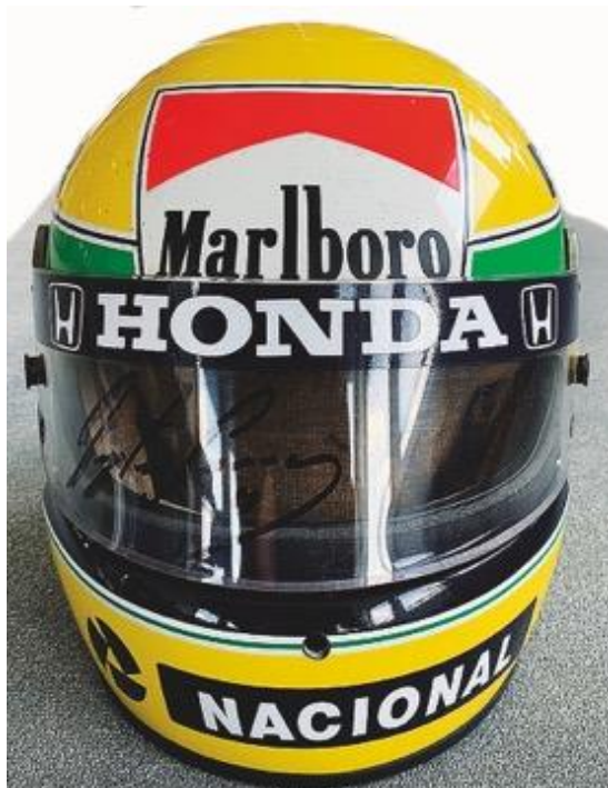
Ayrton Senna's crash helmet from the 1988 Formula 1 season ; €102,000