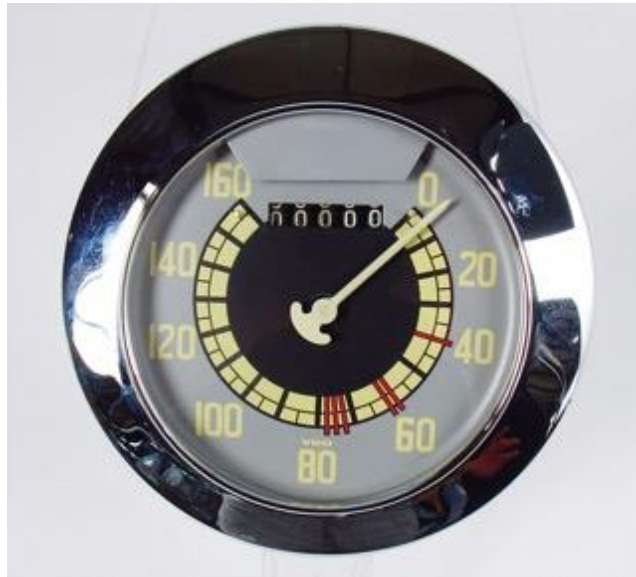
Speedometer Porsche 356 Gmünd from 1949; €10,070