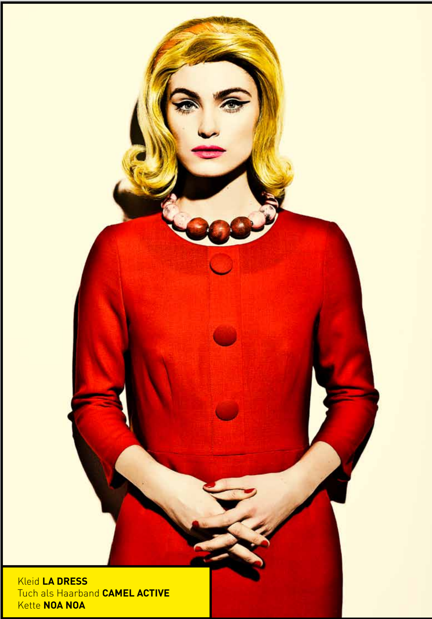
Kleid LA DRESS Tuch als Haarband CAMEL ACTIVE Kette NOA NOA