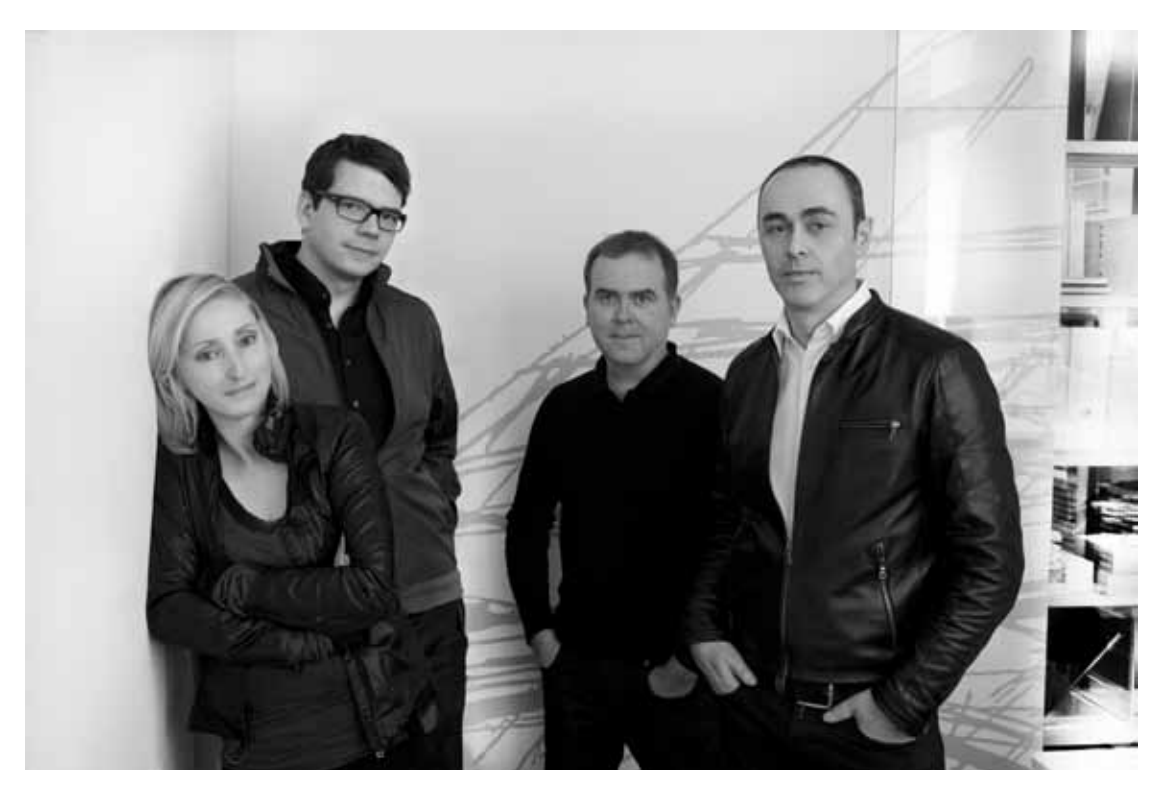
B2 I The Delugan Meissl Associated Architects studio has accommodated trendsetting technology in a sophisticated design.

Dimming of brightness levels from 10-100% and the adjustment of a variety of colour temperatures are possible either via DALI or directly on the spotlight's track box, by means of a rotary regulator. The spotlight is available in a matt black and matt white finish as standard. A five-year guarantee is granted for the luminaire range including control gear and LED. Stable White versions of Iyon will be available from May 2011. Tunable White will be available from autumn 2011.