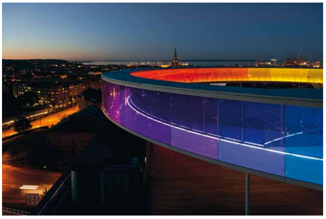
B2 I Special uplights recessed into the floor make the unique installation glow in all colours of the spectrum – just like a real rainbow. For this purpose, the ceiling is symmetrically illuminated, so that the coloured glass panels seem to radiate colours from inside.