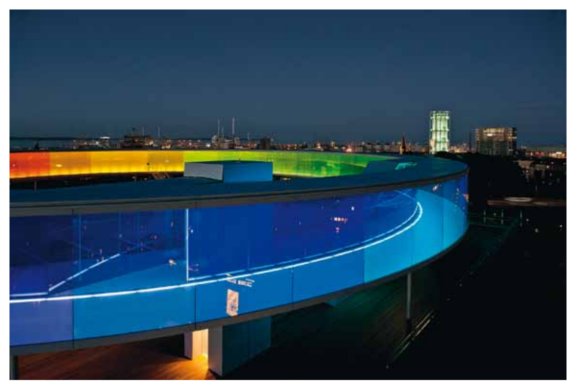
B1 I The panoramic walkway "Your rainbow panorama" with coloured glass walls is illuminated by a special solution provided by lighting solution expert Zumtobel.